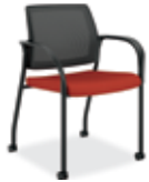
MULTI-PURPOSE STACK CHAIR W/ARMS