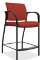
HIP CHAIR For Healthcare Applications